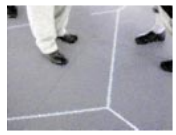
Boundary Function Scott-Sona Snibbe