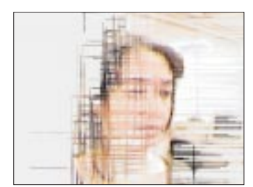
Screen Play Emily Weil